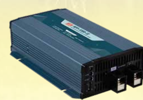
NPP Series Fixed Type - 2 in 1 Charger & Power Supply