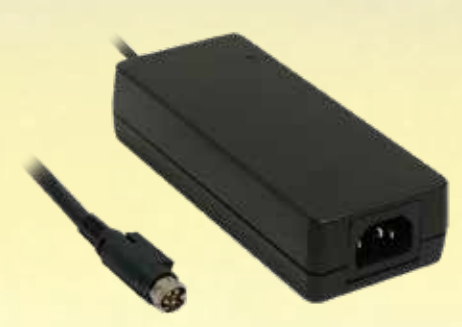
GC Series Portable (Plastic Case)