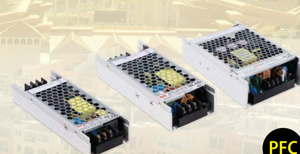
VFD-C-230 Series U-Shaped Enclosure (With PFC)