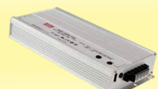
HEP Series Harsh Environments