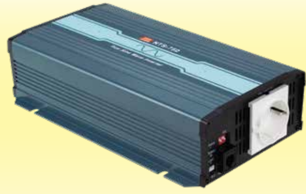
NTS/NTU Series Sine Wave - Off-Grid Type