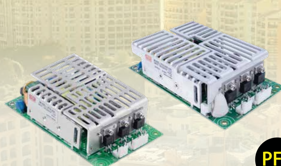
VFD-P-230 Series PCB Type (With PFC)