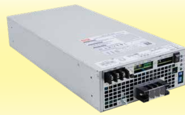
NTN-5K Series Sine Wave Off-Grid Type - Supports 5 + 1 Units in Parallel up to 30KW