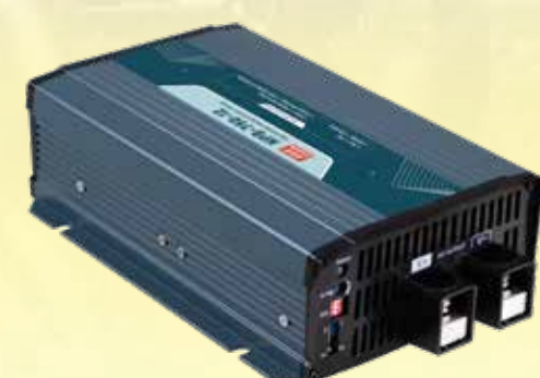
NPB-450~1700 Series Fixed Type - Screw Locking