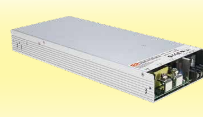
BIC Series Bidirectional Power Converter