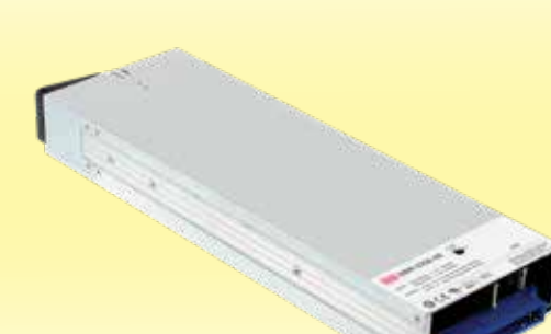
DBR Series Enclosed Type - Programmable Voltage/Current