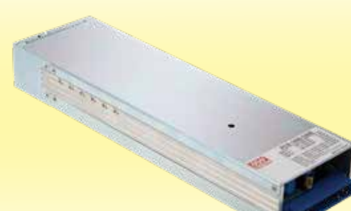
RCB Series Enclosed Type - Programmable Voltage/Current