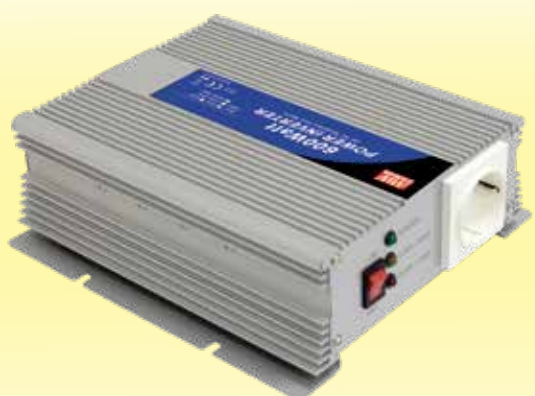
A301/A302 Series Square Wave - Off-Grid Type