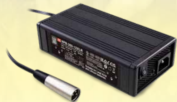
NPB-120~360 Series Portable (Metal Case)