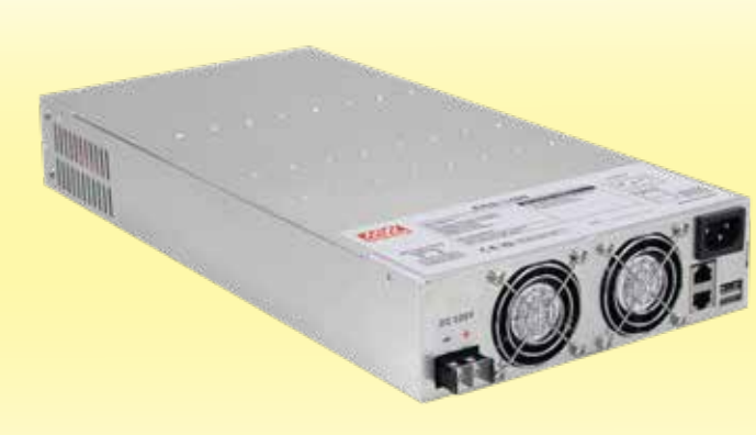
ERS/ERG Series Energy Recovery Type