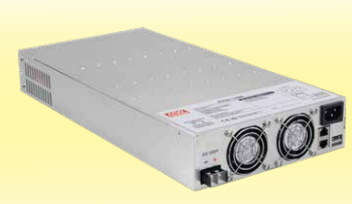
ERS/ERG Series Energy Recovery Type