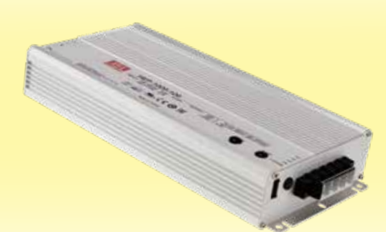
HEP Series Harsh Environments