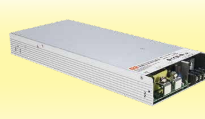
BIC Series Bidirectional Power Converter