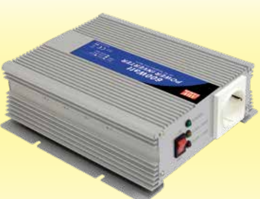
A301/A302 Series Square Wave - Off-Grid Type