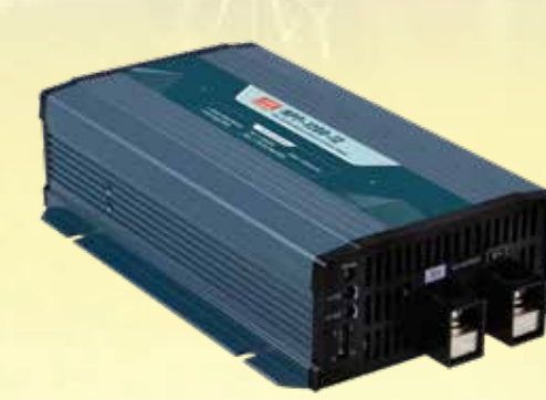
NPP Series Fixed Type - 2 in 1 Charger & Power Supply