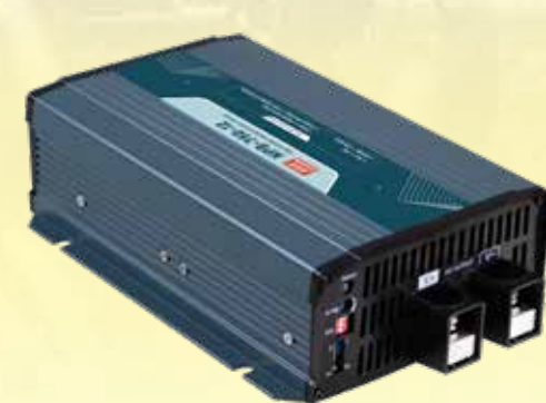
NPB-450~1700 Series Fixed Type - Screw Locking