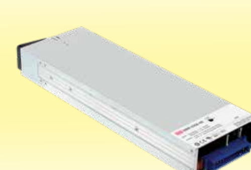
DBR Series Enclosed Type - Programmable Voltage/Current