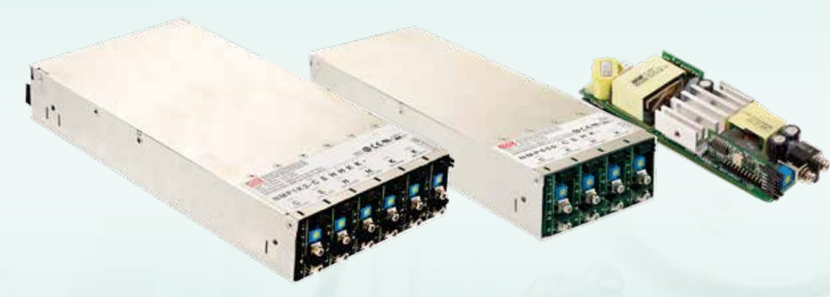
Front: NMP-650/1K2 Series Output Module: NMS-240 Series